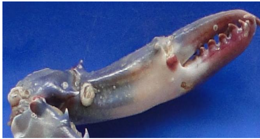
Fig. 2, showing the bent in the left cheliped in female when closed.