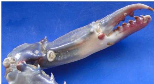
Fig. 3, showing the bent in the left cheliped in male when closed