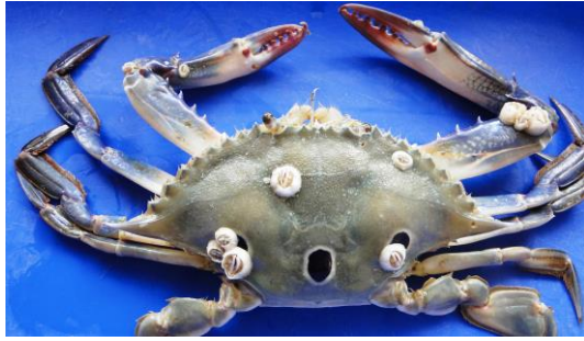
Fig. 1, showing the difference between right and left cheliped in the same animal