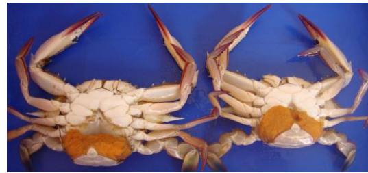
Fig. 1: Showing the egg mass

Stage 1: Newly spawned egg: The eggs were round and golden yellow in colour. The undeveloped and mass of undifferentiated cells were also found in the berry. The yolk granules were denser. The cleavage and gastrulation were not clear. The diameter of the freshly laid egg was 0.34mm as shown in fig. 1.